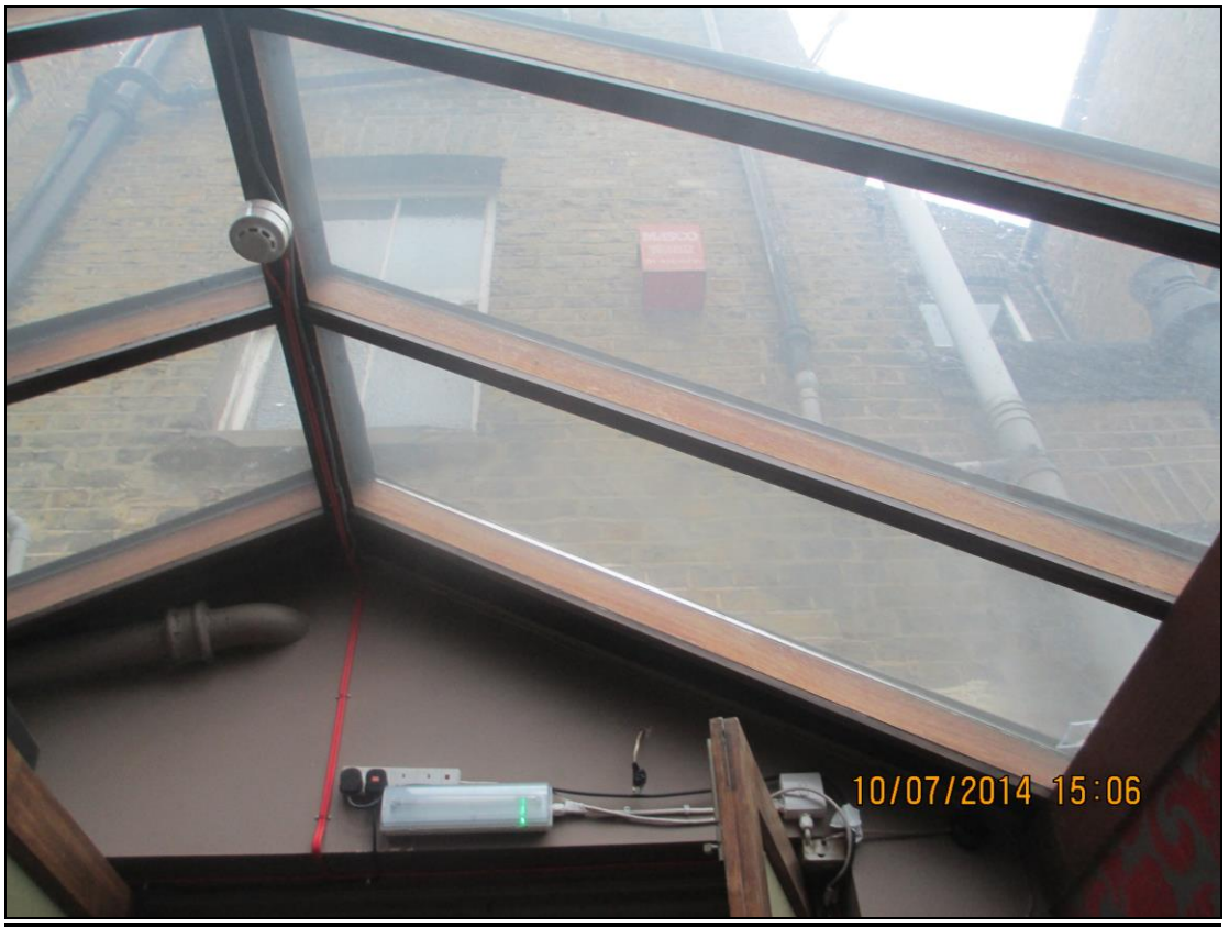
Image 3: Views of the 1<sup>st</sup> floor rear elevation from within the rear section of the existing pub.